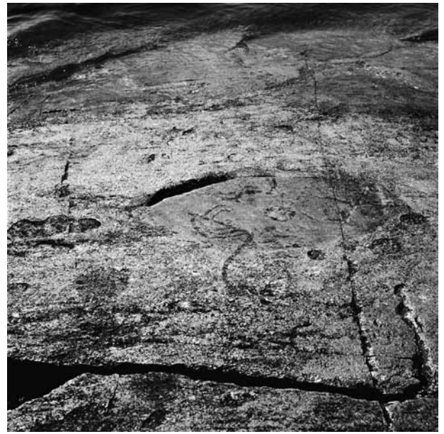
Fig. 8 Lake Onega, The Birth of the World, Guri Island, Russia 2006