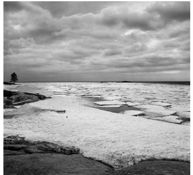
Fig. 10 Lake Onega, Cape Besov Nos North, Spring, Russia 2009