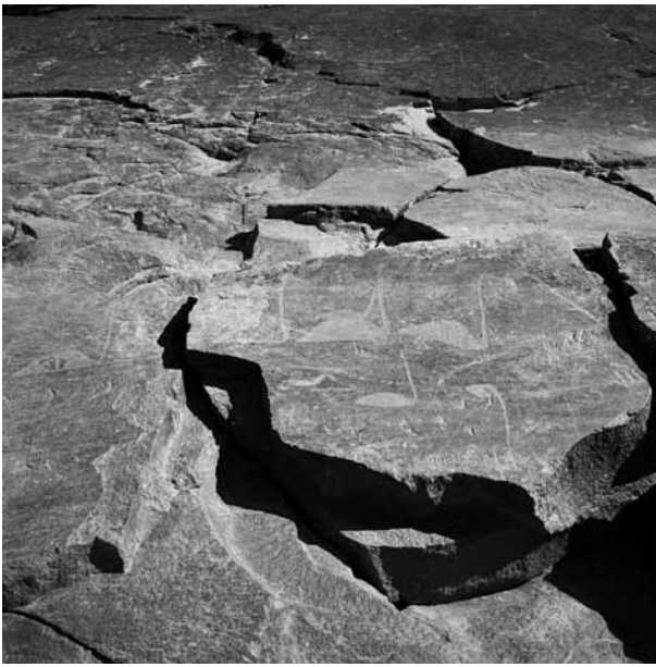
Fig. 7 Lake Onega, Transporting the soul, Cape Besov Nos, Lake Onega, Russia 2009