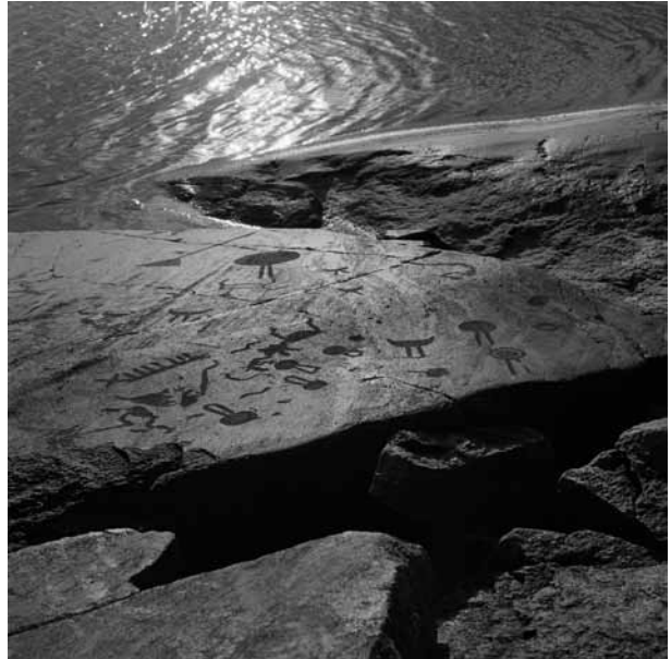
Fig. 3 Lake Onega, Cape Peri VI, Summer Evening, Russia 2006