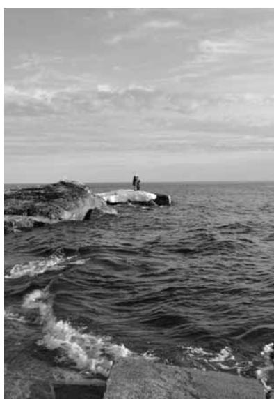
Fig 0 Lake Onega, Marjukka Vainio and Riitta Virtanen, Guri Island, Spring, Russia 2009