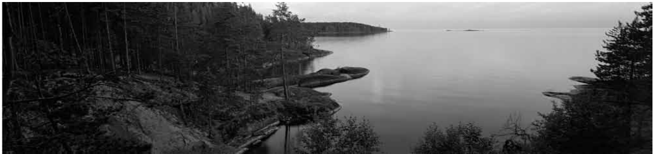
Fig. 4a Lake Onega, The view from Cape Peri to Cape Besov Nos, Summer Evening, Russia 2005