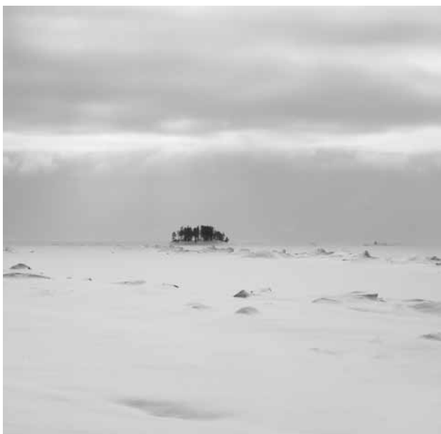
Fig. 11 Lake Onega, Guri Island, Winter Morning I, Russia 2010