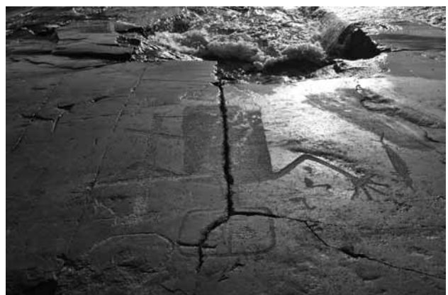
Fig. 6 Lake Onega, Bes, Cape Besov Nos, Lake Onega, Autumn, Russia 2009