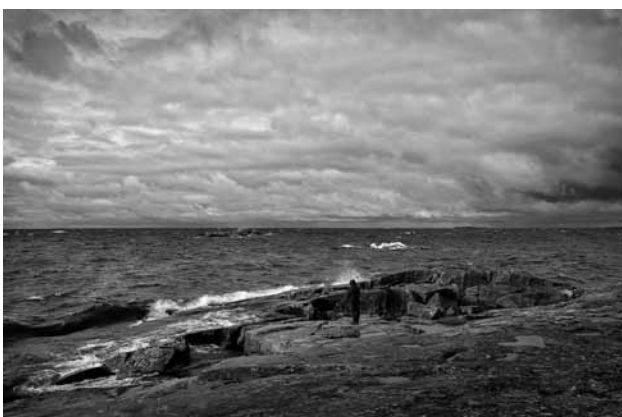
Fig. 5 Lake Onega, Cape Besov Nos, Autumn, Russia 2009