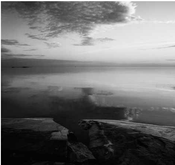
Fig. 9 Lake Onega, Summer Evening I, Russia 2005