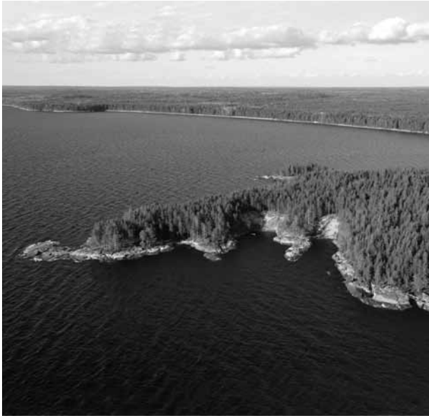
Fig. 2 Lake Onega, Cape Peri, Spring Evening, Russia 2009