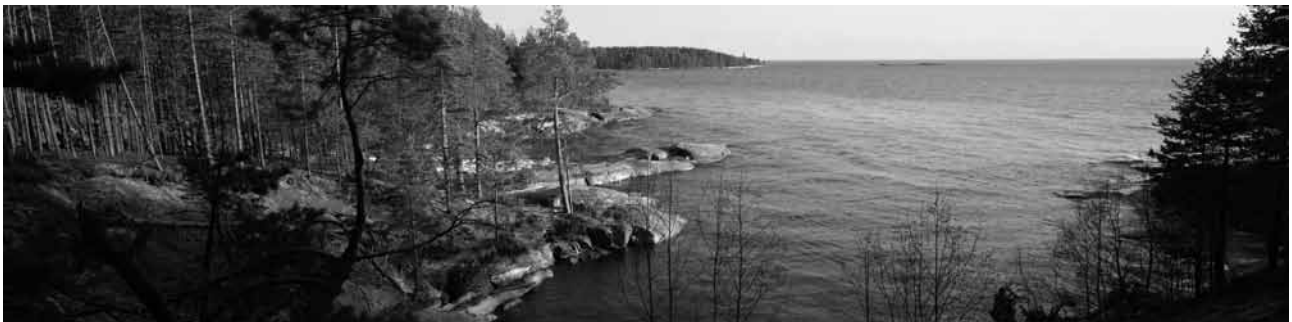
Fig. 4b Lake Onega, The view from Cape Peri to Cape Besov Nos, Spring Evening, Russia 2009